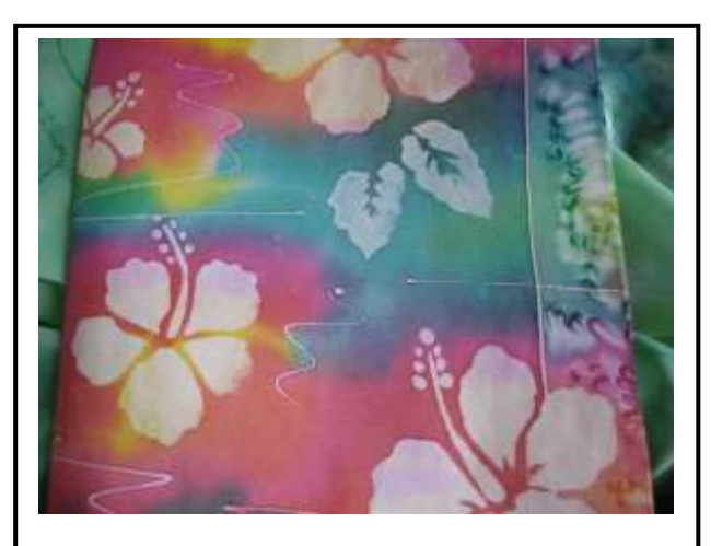
Water Soluble Batik Techniques