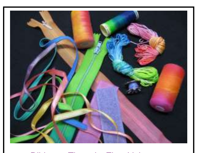
Ribbons, Threads, Zips, Velcro, ...