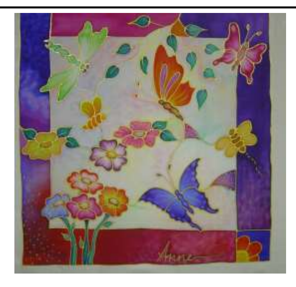
Traditional Silk Painting