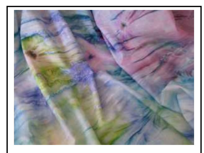
You'll be amazed at the simplicity of using our Liquid Radiance, and the array of effects it can achieve.