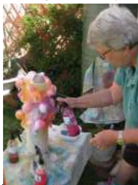
Colours: orange, red, magenta, and brown

Watch the "Events" page of my website for more details as they are announced, and for information about our special discounts throughout the entire month of July.