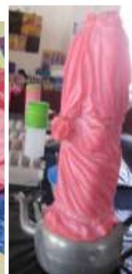
Two x 2 litre milk bottles taped together bottom to bottom made a perfect 'pole' for the red t-shirt.