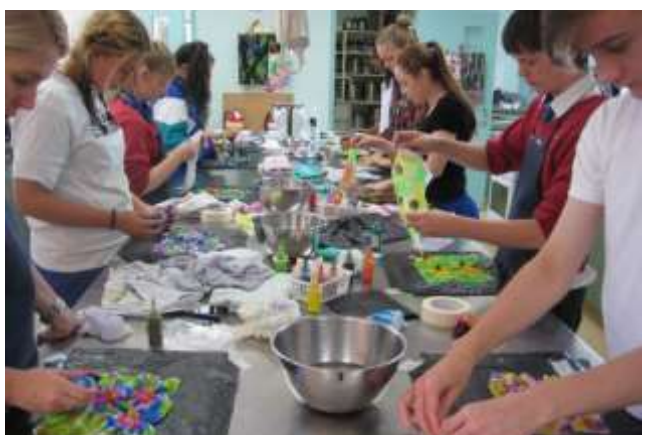
Workshop with Year 12 students, Southern Cross College, Scarborough Q – April 2015

Ask for full details and registration. GOOD NEWS: Pay in full one month before your chosen program and qualify for Early Bird Discount.