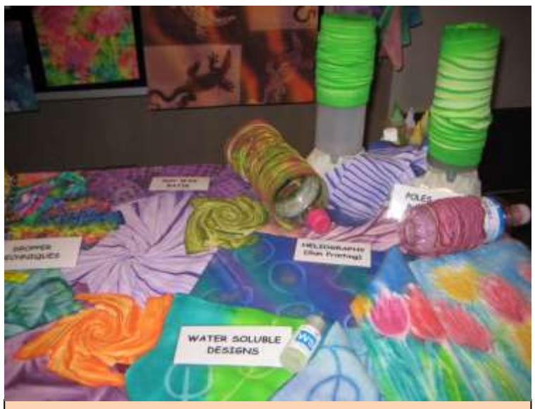
Part of our display – Home Economics National Conference in Perth, October 2014

Home Economics Qld Conference, Brisbane – Sat 1 Aug – Brisbane Convention Centre. Teachers, watch for my email about our Conference Specials – details will be emailed to you in early July. Pre-order so we can deliver your goodies at the event.