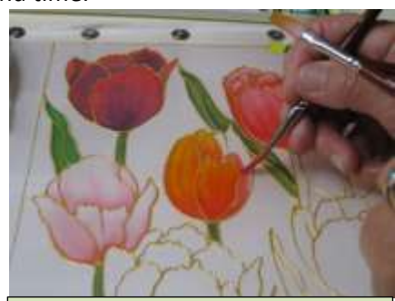
Silk Painting – "Tulip Time" Issue #47 [Sept '21] – teaches colour blending. Back issues with all my projects are still available from us while stocks last.

Video-ing for YouTube ... will continue, and new topics will be added to both my YouTube channel and my website. Only the formal Introductory and Advanced Web Workshops will appear on both. Some of the "In Focus" web workshops will appear as single topics and 'Quick Topics' on YouTube. Check out what's already there NOW to revise and expand your skills!