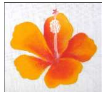
Yellow, red and white used in different ways to develop 3D effects. You'll learn how simple it really is!

DATES: Thu 22 and 29 Feb start at 10 am, and on Sat 24 Feb and 1 March at 2 pm. Register now. Numbers will be limited for this course.