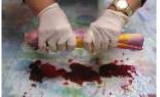
Image at R – excess squeezed out. Of course it was mopped up into another piece of fabric ready to handle as desired. Unroll and lay fabric flat.

FOLD, SPLIT, n SCRUNCH – great for large light-weight fabrics.