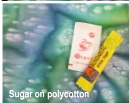
Sugar on polycotton

But if you like it that way, sorry, you're out of luck! This extra colour is removed during rinsing, as it IS just food colouring. And finally, let's think of the age-old rule: working with SALT is at best random. It's the same with SUGARS! And just as much fun.