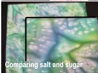
Comparing salt and sugar