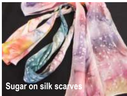
Sugar on silk scarves

Most of us are familiar with salting on fabrics, and love it. Sugars are equally addictive (and not fattening at all when used in fabric designing!) I enjoy the 'spookiness' and 'dotty-ness' of the effects that sugars create - and just as different salts produce different effects, so will different sugars. Soooo ... look into your pantry and see what you can find. Raw sugar, white sugar, caster sugar (finer markings because the grains are smaller), maybe coffee crystals, brown sugar, and Hundreds and Thousands!