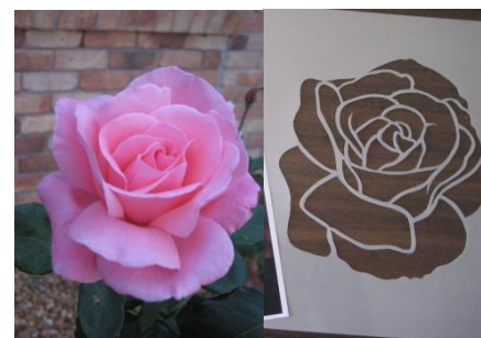
From photo to completed stencil – the 'how to' is in December Embellish

More good news about Embellish articles ... I've been booked to write four more projects. They'll be in their quarterly magazines starting with June '18 issue.