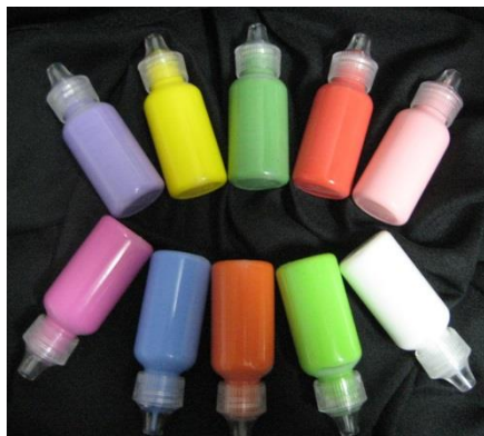
Pictured before labels were put on so you can see the colours better!

Our paints and colours are very different from anything else 'out there' in the marketplace – that's why it's so important that you have my support, as well as that of our GC teachers, to help you make the most of their use, and achieve the effects that you want to create. It's great to think back to where it all started, and realise that with help from people who also cared about quality products, we have achieved what we started out to do 24 years ago.