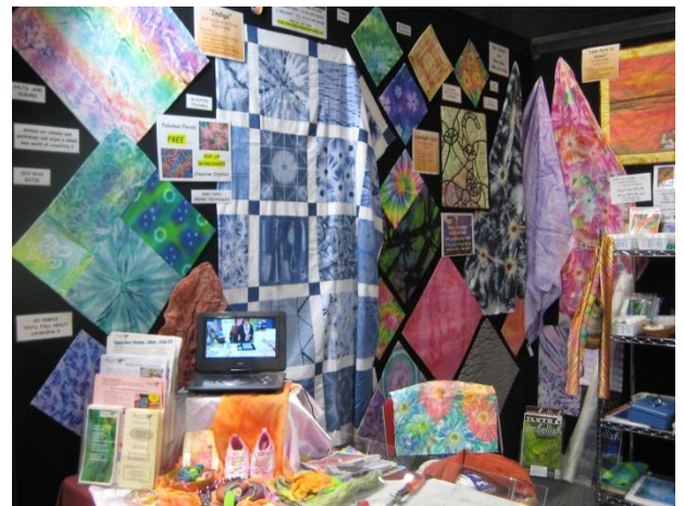
Part of our stunning display in Adelaide Australian Machine Quilting Festival - Sept 18

18,754 kilometres, and still counting! Wow, I knew 2018 was going to be full-on when I wrote up my own workshop programs on my planner about this time last year (pays to plan ahead – ‘major trips’ always go in first). But when I checked the records in my car’s log book from the start of those programs till now, I admit I gave myself a bit of a shock. By the start of the year, Albury, Eidsvold, Townsville and Rockhampton were already on the drawing board. Then early this year I was invited by the Home Economics workshop coordinator to travel to far flung places and conduct professional development sessions with teachers all over Queensland. Add to that the quilt shows in Port Macquarie and Adelaide that were already carved in marble in my diary. So really, it’s not too surprising that we clocked up so many kilometres. But my car and I are both happy to be at home for a few weeks now. Garden is pleased too! At last it has had a bit of attention, and I’m happy to sleep in my own bed for a while. One more trip before the end of this year to add another 3 ½ thousand kilometres to the score – to Melbourne for DATTA* International Conference where I’m presenting hands-on workshops during their concurrent sessions – then my year is done! [*DATTA = Design and Technology Teachers’ Assn]