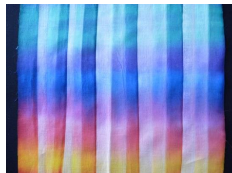
ABOVE: Pleats opened and ironed. The colours in the piece above are different from those in the sample below.