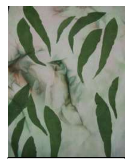
Gum leaves stencilled in Eucalypt Flat paint, on background of Liquid Radiance mop-up

This year our Flat paint range has been updated and now includes NEW COLOURS and a new concept. Instead of ordering them in large batches and having them sit for often long periods before leaving our Distribution Centre, I am now making the paints virtually 'on demand' here in my Studio. Armed with the paint base and colourants, it's a simple task to put them together and bottle them as required so the paints are always fresh.