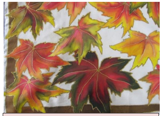
Love the drive south, as the leaves turn to their russets and golds along the New England Highway – always a source of inspiration. Find some autumn leaves, trace around them, and capture their beauty in silk painting or fabric art techniques

I know that the next few months will see me jumping out of bed with my running shoes on ... and definitely dancing with joy. There are craft shows and workshops lined up in my year planner ... and I hope you too will be involved in some of