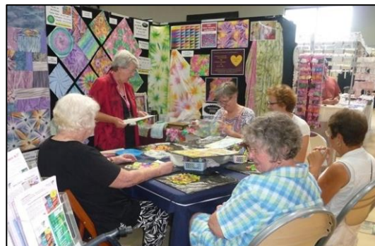
Rockhampton ladies enjoying our free workshops at Craft Alive

Halifax – Tue 30 th and Wed 31 st May – Fabulous Fabrics – two-day workshop with RADF funding