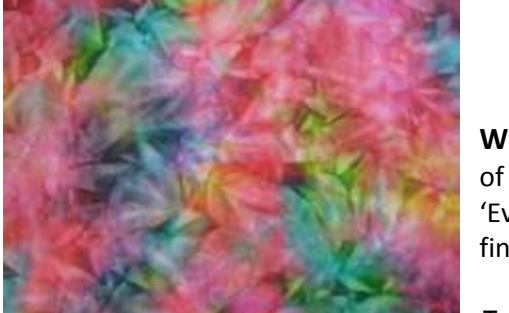
Microwave techniques create amazing patterns using the heat and steam generated in the microwave oven. Liquid Radiance is NON TOXIC so it is safe to use the same oven for your fabrics as for food. Check my website for the hands-on workshops, or FREE microwave demonstrations.